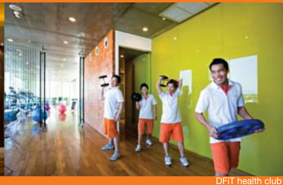
DFIT health club