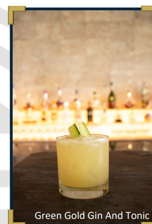
Green Gold Gin And Tonic