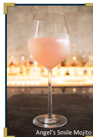
Angel's Smile Mojito